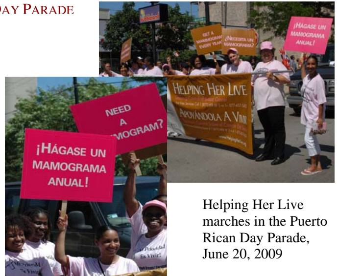
Helping Her Live marches in the Puerto Rican Day Parade, June 20, 2009

HHL participated in the Puerto Rican Day Parade to raise awareness about breast cancer in Humboldt Park and encourage women to get a mammogram. Over 700 HHL palm cards were distributed with our hotline and program information. Our presence was felt by over 20,000 people who attended the parade and has led to increased visibility of HHL in the community. Everyone left the parade knowing that early detection is the best method of preventing breast cancer mortality and that this Avon-funded program will help women obtain free or low cost mammograms.