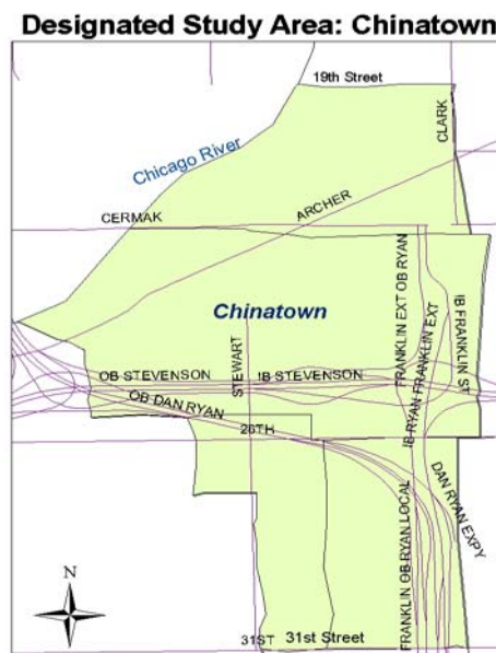
Figure 1: Study area – Census Tracts 3401-3404